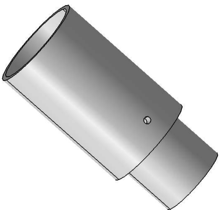
Isometric view Scale: 1:1